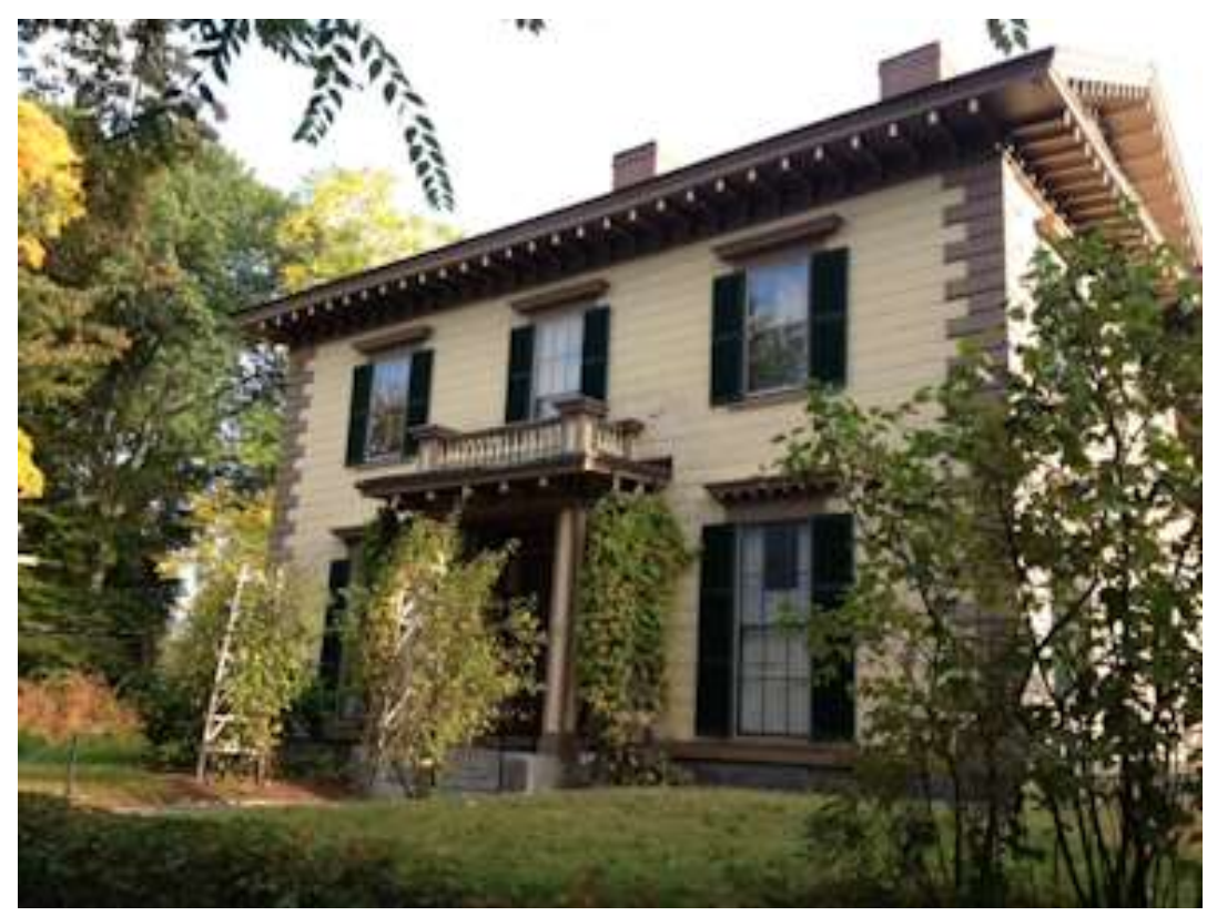
Figure 3: Boutwell House

In 2010, Boutwell house suffered two very serious water pipe failures which flooded portions of the museum's exhibition and work areas. The Board of Directors brought in several new members, wrote a long-range plan, and applied for grants. The GHS request for $176,525 was approved at the 2012 spring Town Meeting. A Cultural Facilities Fund grant for $79,000 awarded in November 2012 from the Massachusetts Cultural Council. The funding was used for physical renovations such as new wiring and plumbing, plaster replacement, a fire suppression system, and a new furnace.