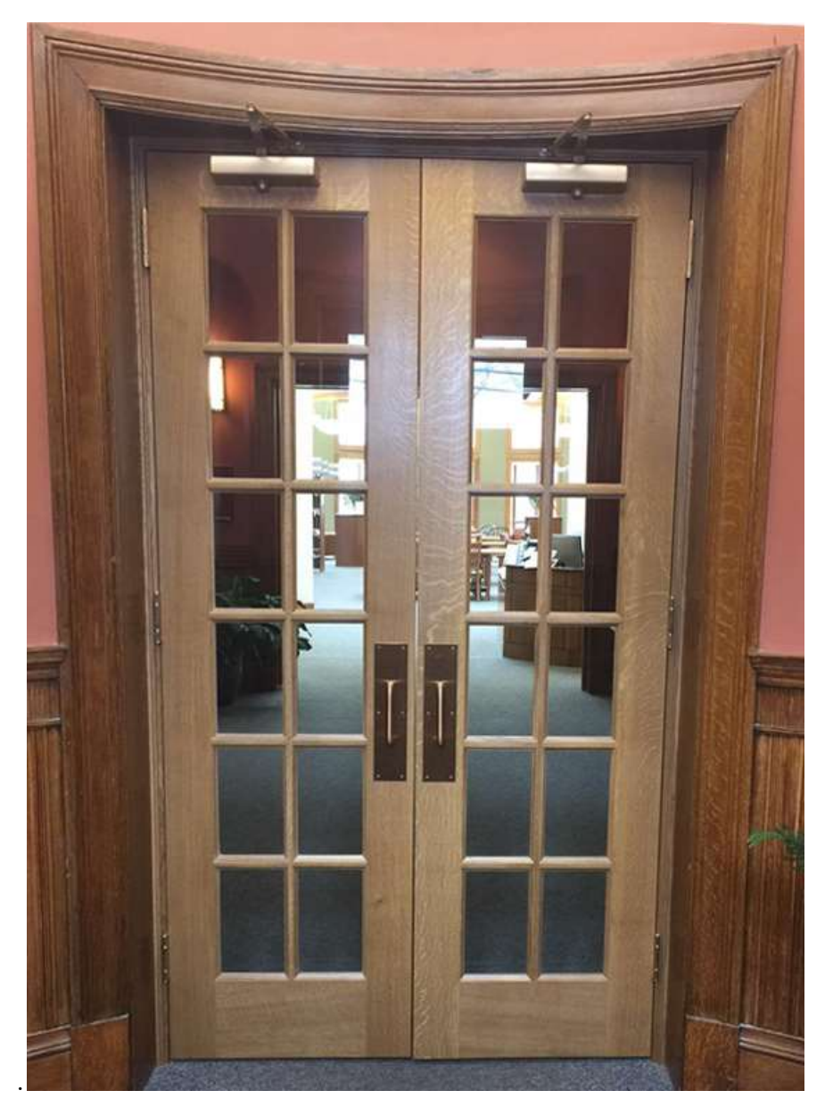
Figure 10: Library Front Entrance Restoration

The 1893 library entrance vestibule originally had a pair of interior doors, but they have been missing for decades. Without inner doors, the adjacent computer and reference areas were exposed directly to the elements and road noise whenever the Main Street door was opened. To make library users more comfortable there was a need to restore the interior doors to mitigate the spikes in temperature and noise. $15,000 was recommended by the CPC and approved by Town Meeting for a pair of custom glass-paneled oak doors, which were crafted in the style and beauty of the historic entryway (see Figure 10 ). The funding was approved at Spring Town Meeting 2017, and the project was completed in March 2018.