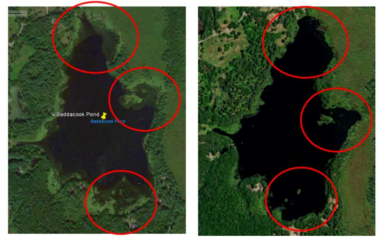
Figure 11: Baddacook Pond Restoration. Left – 2016, Right - 2019

This project will pave the way for Baddacook Pond environmental sustainability under town direction. As shown in Figure 11 , improvements have been made.