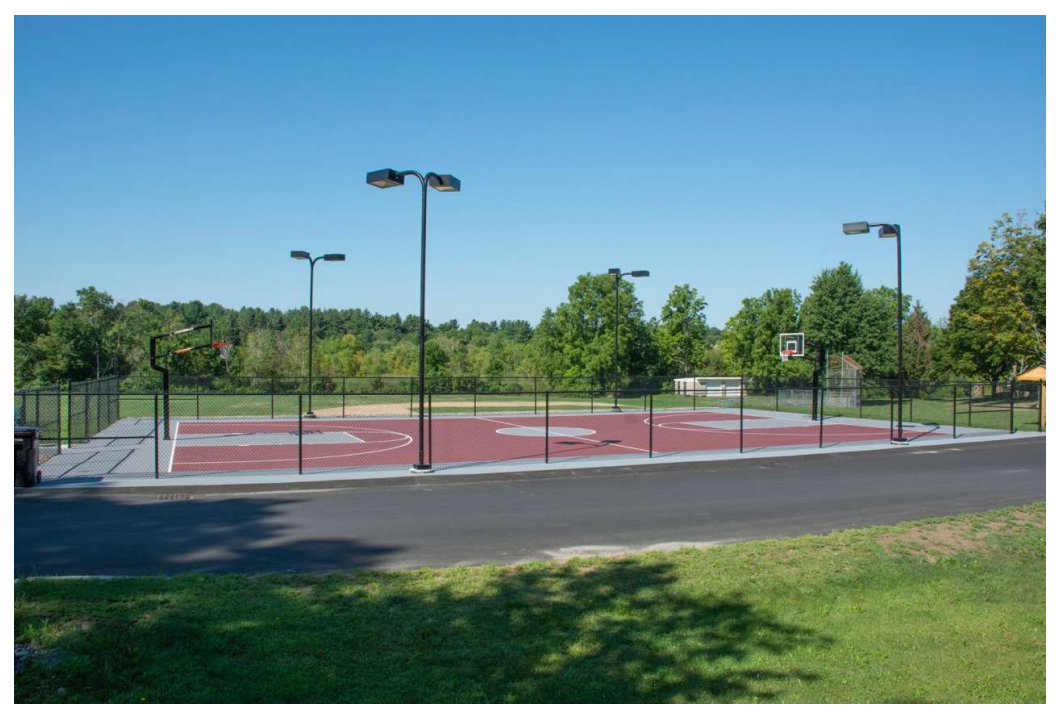
Figure 8: Town Field Basketball Court

The town's two aging, long neglected, and unsafe basketball courts, one at Cutler Field in West Groton and one at the town field (see Figure 8 ), underwent full-scale restoration. The town field restoration included lights that allow for evening play. The Park Commission request for $109,000 was approved at the 2016 spring Town Meeting. The DPW provided the majority of labor and materials for the projects.