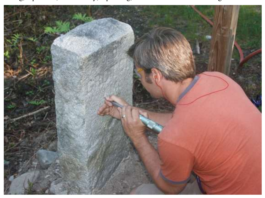
Figure 9: Milestone Restoration

The Groton Historical Commission in 2014, 2015, and 2016 completed the restoration, re-erection, and painting of 27 milestones (see Figure 9 ) throughout the town. Originally erected in 1902 and 1903, they marked the distance to Groton Town Hall. Two of the original monuments were missing or broken. These were recreated by Garside Monuments of Westford and marked on the reverse with the date of 2014. In 2015 five slate milestones erected by Dr. Oliver Prescott in 1787 were cleaned, cracks filled and two previously broken ones were repaired. A separate granite boulder, engraved by Jonas Prescott in 1680, Dr. Oliver Prescott in 1784 and by S. J. Park in 1841, was recommended to be moved to town center. In 2016 the commission began the location, cleaning, repair and, as necessary, repainting, of over 53 monuments throughout the town.