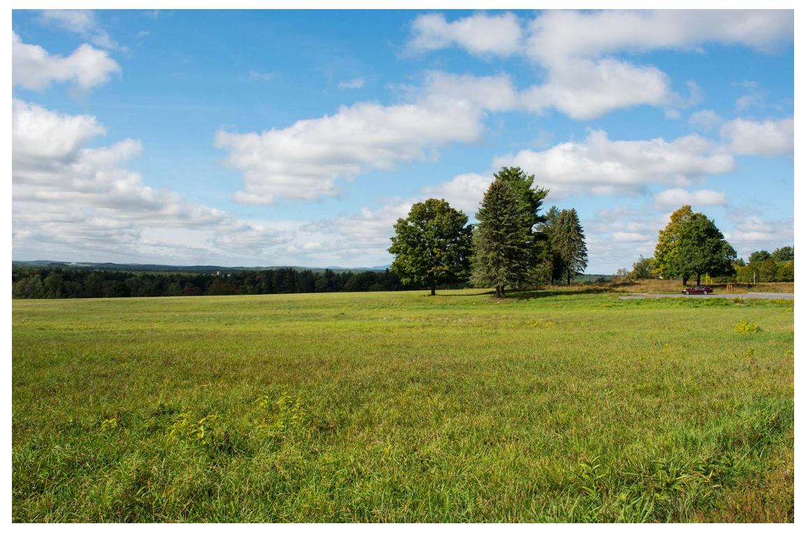
Figure 2: Surrenden Farm

The approximately 360 acres of land known as Surrenden Farm (see Figure 2 ) is immediately adjacent to Groton School and is a key conservation parcel; it has extensive Nashua River frontage and is close to other large blocks of conserved land, including the Oxbow National Wildlife Refuge, Nissitissit River Wildlife Management Area, and the Groton Town Forest. The Town/Conservation Commission request for $5,600,000 was approved at the 2006 spring Town Meeting. The Town's contribution was part of the approximately $20 million required to complete the purchase. The Town's portion is financed by a multi-year bond being repaid with CPA funds.