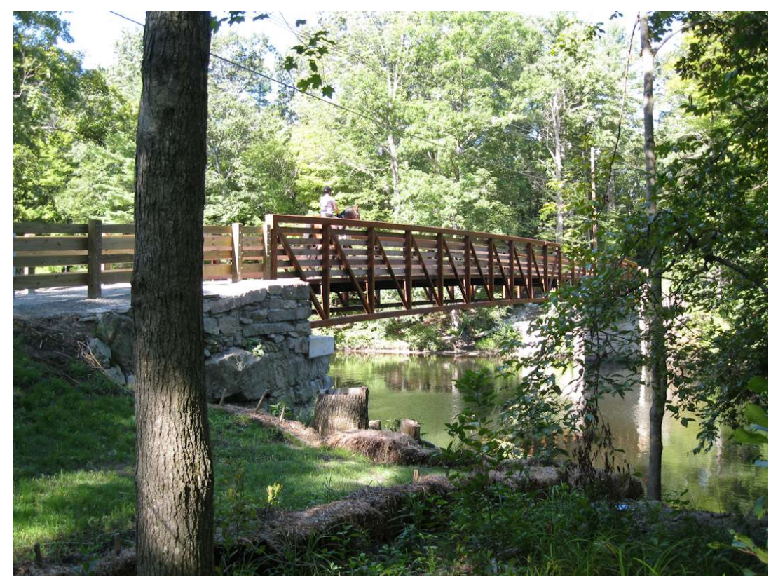
Figure 4: Fitch's Bridge

A new Fitch's Bridge (see Figure 4 ) replaced the historic and seriously deteriorated iron bridge. Fitch's Bridge is a historic connection between Groton and West Groton, with ferry and bridge links dating to the early 18<sup>th</sup> century. The previous bridge decayed to the point where it was becoming a nuisance and safety hazard. The new bridge now connects to the Groton Trail network, linking over 70 miles of trails in Groton with over 30 miles of trails in West Groton. The Groton Greenway Committee request for $225,409 was approved at the 2013 Spring Town Meeting.