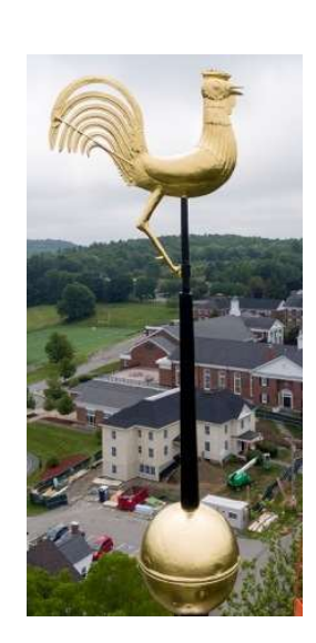
Figure 7: First Parish Restoration – Buddy Installation