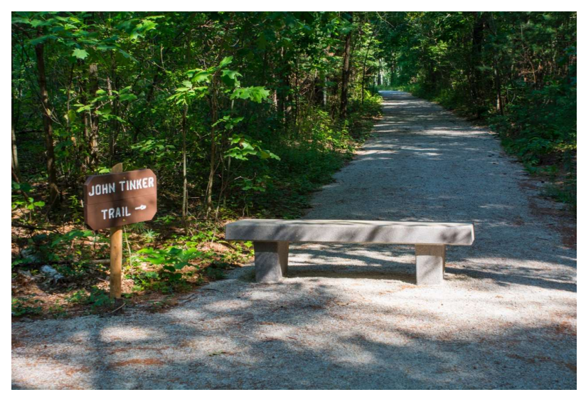
Figure 6: John Tinker Trail

Under the guidance of the Trails Committee, a new 0.22 mile, fully handicapped accessible trail was created along the Nashua River in J. Harry Rich Forest off Nod Road. It includes a parking lot and three rest viewing areas. The John Tinker Trail (see Figure 6 ) is named after Groton's founder and first selectman. The total cost of the project was $32,554. The Trail Committee request for $24,392 was approved at the 2015 spring Town Meeting. A Mass Dept. of Conservation and Recreation (DCR) grant was received, so the total CPA portion was $1,717; used to cover rental of stump grinder and buy handicap parking signs. Unexpended funds are returned to the appropriate CPC account.