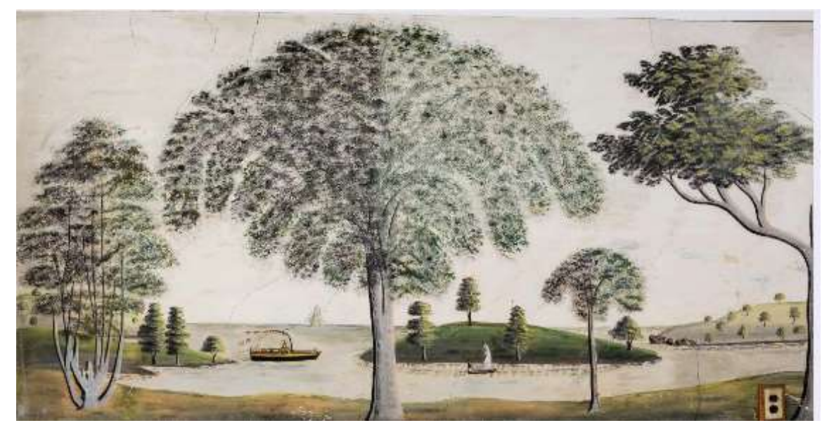
Figure 12: J.D. Poor Mural

Finally, the murals were created by David Ottinger and transported to the Groton Inn on May 5, 2019. The murals are now on display in The Groton Inn lobby, accessible for easy viewing by Town residents and visitors. These Poor murals will have the distinction of being the only ones in Groton available for the general public to view.