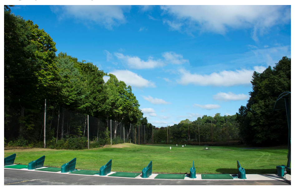
Figure 5: Country Club Driving Range Improvements

The Groton Country Club driving range (see Figure 5 ) benefits from major improvements including new poles and netting that allow any use of any club, new range mats, and a new range picking machine for improved ball retrieval. The Country Club request for $47,000 was approved at the 2015 Spring Town Meeting.