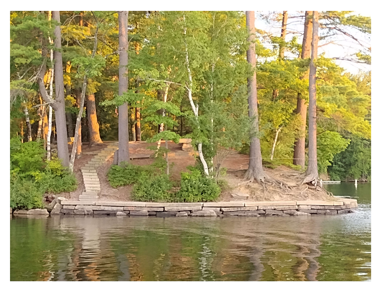
Prepared by the Groton Community Preservation Committee